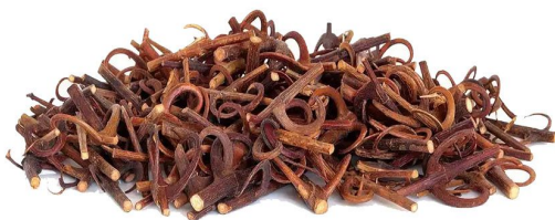
Uncaria gambir root